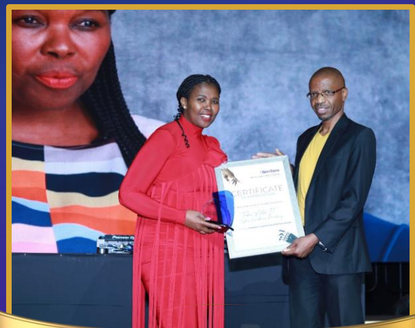
COMMUNITY BUILDER RECOGNITION AWARD Take Note IT Cyber Excellence Academy

Here are the winners Representatives of companies who won the SMME Award, Government Technology Leader Award and Digital Education did not attend the award ceremony, but sent video messages acknowledging the award.